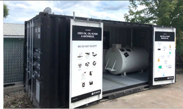
A shipping container converted into an oil-recycling facility – like this one in Vernon – has come to GFL Transfer Station and Recycling Facility on Vye Road in Abbotsford.

BCUOMA's mandate is to ensure the responsible collection and management of the used oil, antifreeze, filters and containers required under the BC Recycling Regulation.